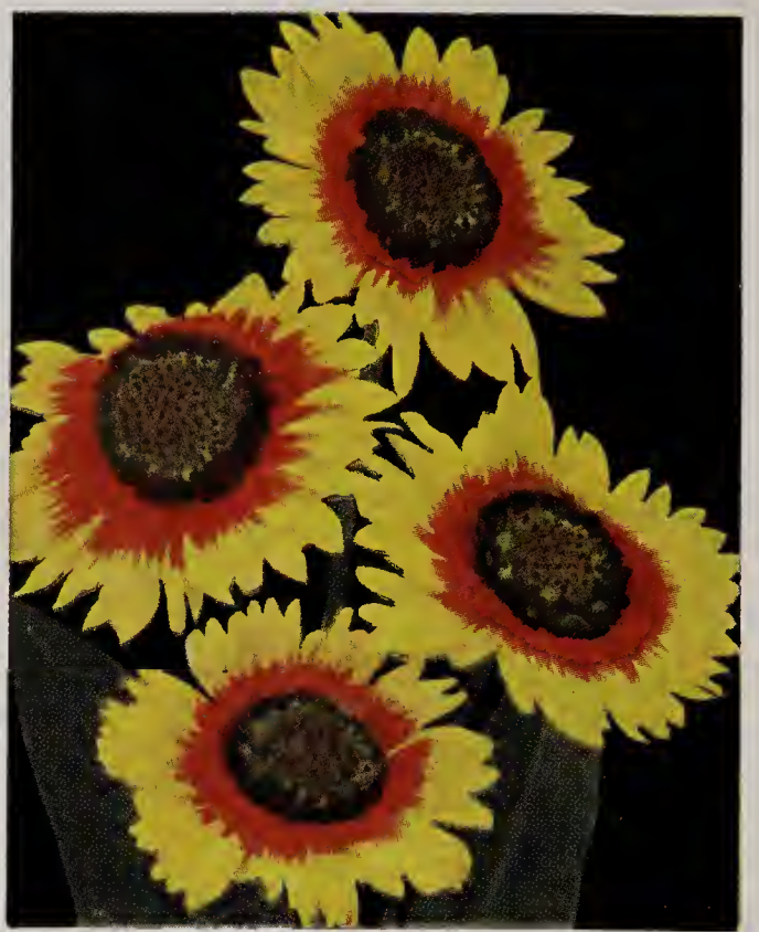
Gaillardia. 20 cts. each